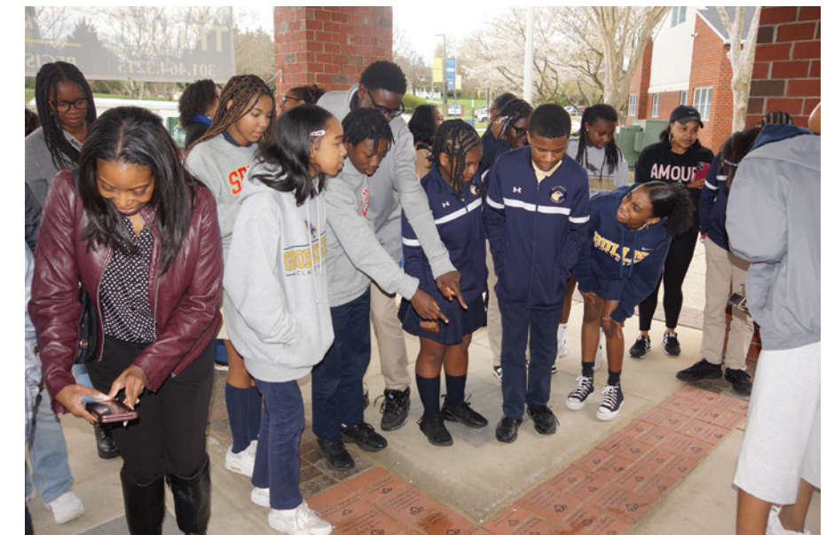
In the spring, we hosted a Memorial Brick Unveiling Ceremony where students, parents, and alumni families joined together to view our new entrance, thanks to Corenic Construction. Everyone was delighted with the results, and we are proud to show the remembrance of those who have shared time and space in the Holy Trinity community.

We were honored to commemorate Holy Trinity's 60th Year Anniversary! We are pleased to see the growth of Holy Trinity over 60 years and are excited for the future, especially with our community's support! In celebrating, we launched a Memorial Brick Campaign, offered Holy Trinity BLING attire, and hosted a Spring Derby Party! Our 60th Anniversary Campaign raised $19,796 with your support! We are grateful to all who donated to this campaign, as it was important to celebrate this milestone event. We would like to thank our sponsors, especially Corenic Construction, for installing our Memorial Bricks and sponsoring our 60th Anniversary Derby Party! Thank you to the community for your unwavering support in these celebratory efforts!