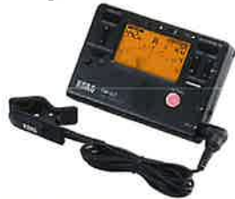
Woodwind and Brass